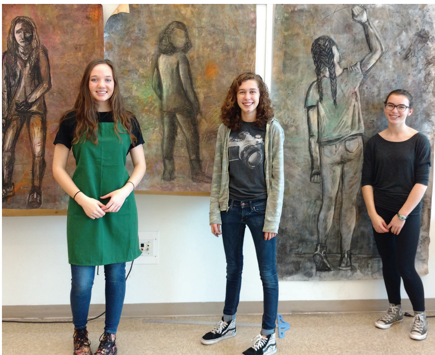
These students used charcoal, chalk, chalk pastel, and a full-length mirror to create near life-size self-portraits over the course of seven class sessions.

The Country Day Loyal Society honors those who have made five or more consecutive annual gifts to Country Day. An asterisk denotes these steadfast donors throughout the donor rolls.