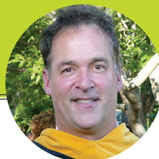
Alumni Association Distinguished Faculty Award winner